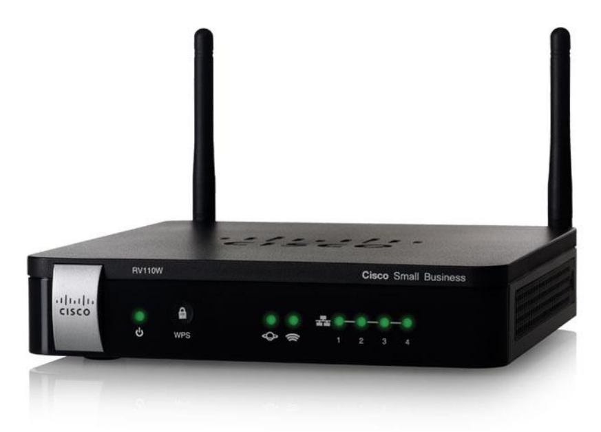
Figure 1. Cisco RV110W Wireless-N VPN Firewall

The Cisco® RV110W Wireless-N VPN Firewall provides simple, affordable, highly secure, business-class connectivity to the Internet for small offices/home offices and remote workers.