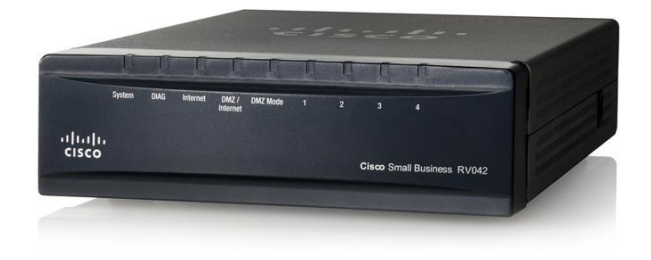
Figure 1. Cisco RV042 Dual WAN VPN Router

To further safeguard your network and data, the Cisco RV042 includes business-class security features and optional cloud-based web filtering. Configuration is a snap, using an intuitive, browser-based device manager and setup wizards.