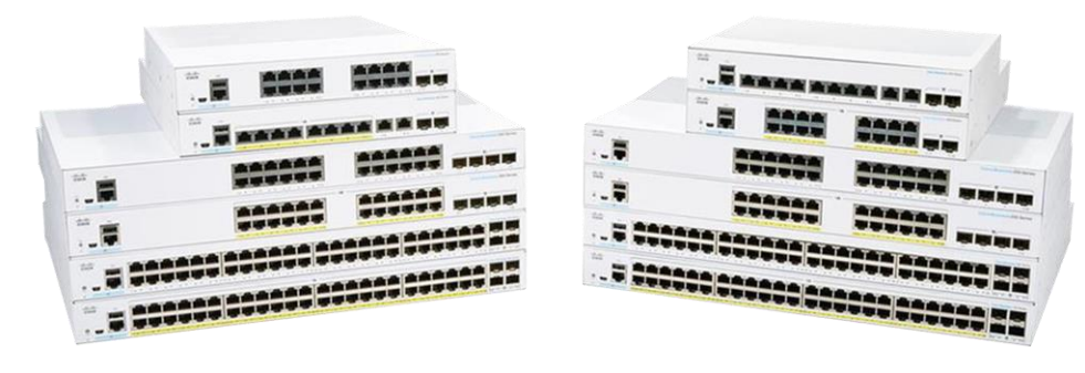
Figure 2. Cisco Business 350 series managed switches

The Cisco Business 350 Series Switches, part of the Cisco Business line of network solutions, is a portfolio of affordable managed switches that provides a critical building block for any small office network. Intuitive dashboard simplifies network setup, and advanced features accelerate digital transformation, while pervasive security protects business critical transactions. The Cisco Business 350 Series Switches provide the ideal combination of affordability and capabilities for small office and helps you create a more efficient, betterconnected workforce. When your business needs advanced networking features and security for the digital transformation yet value is still a top consideration, you're ready for the Cisco Business 350 Series Switches.