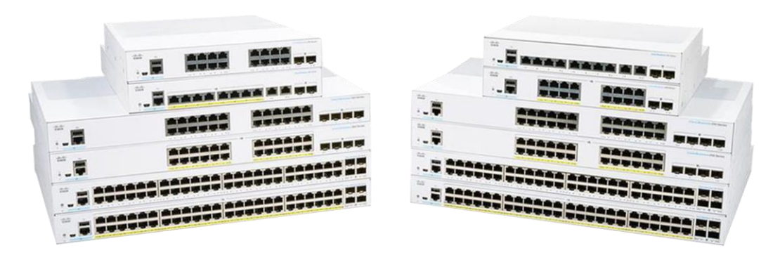
Figure 2. Cisco Business 250 series smart switches

The Cisco Business 250 Series is the next generation of affordable smart switches that combine powerful performance and reliability with a complete suite of the features you need for a solid business network. These switches provide flexible management options, comprehensive security capabilities and Layer 3 static routing features far beyond those of an unmanaged or consumer-grade switch, at a lower cost than for fully managed switches. When you need a reliable solution to share online resources and connect computers, phones, and wireless access points, Cisco Business 250 Series Smart Switches provide the ideal solution at an affordable pricing point.