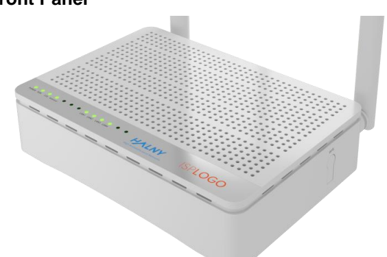
Fig. 1 - Front Panel

The description of the front panel and the rear panel of the GPON ONU as follows. 2.2.1 Front Panel