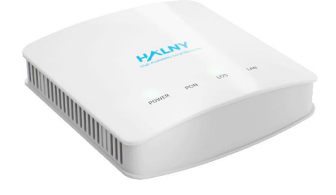
Fig. 1 - Front Panel