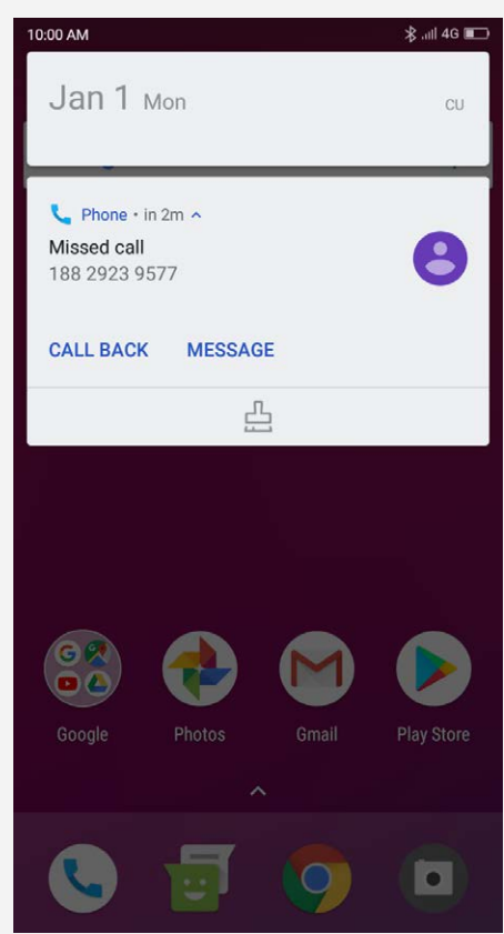
Figure 1: Notifications

The Notifications panel (see Figure 1: Notifications) informs you of missed calls, new messages, and activities in progress such as file downloading. The Quick Settings panel (see Figure 2: Quick Settings) allows you to access frequently-used settings such as the WLAN switch.